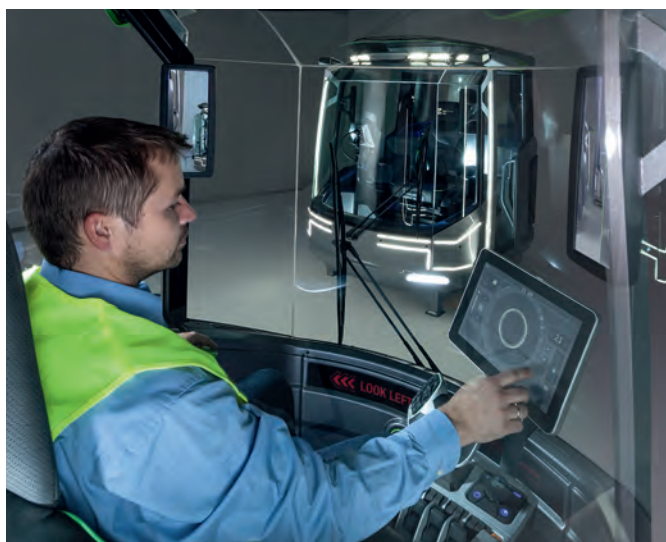
ABOVE: The CCC partners developed the 'Genius' model cab by pooling their expertise

Numerous electrically powered functions, including adjustment of the seat's fore/aft